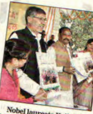
Nobel laureate Kailash Satyarthi and CM Raghubar Das in Koderma on Sunday.