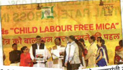
Is "CHILD LABOUR FREE MICA" त्रि को बाल श्रम मुक्त करने की पहल

Ranchi: Chief minister Raghubar Das on Sunday announced that his government will