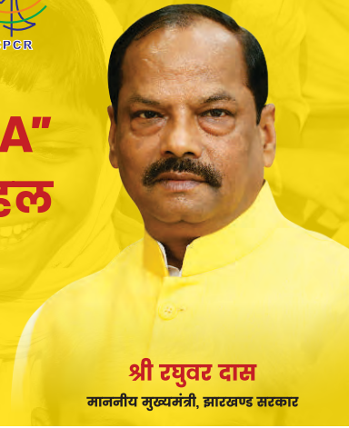
श्री रघुवर दास माननीय मुख्यमंत्री, झारखण्ड सरकार

28 अक्टूबर 2018 | बागीटांड स्टेडियम, कोडरमा