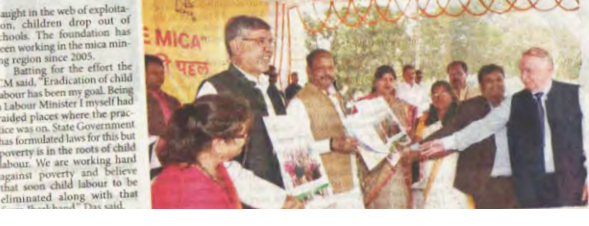
Is "CHILD LABOUR FREE MICA" त्रि को बाल श्रम मुक्त करने की पहल

PNS RANCHI The Jharkhand Government has signed a MoU with Kailash Satyarthi Children's Foundation (KSCF) established by Nobel Peace Laureate Kailash Satyarthi. Foundation is working extensively in mica mining areas of Koderma, which employs numerous underground workers. Chief Minister Raghubar Das along with Kailash Satyarthi was in Koderma on Sunday where he reaffirmed his commitment to eradicate child labour from the state.