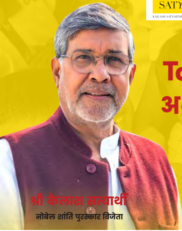
श्री कैलाश सत्यार्थी नोबेल शांति पुरस्कार विजेता